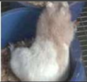
Male on aspartame whose hind legs became paralyzed.