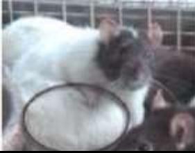
Female on aspartame often used her tumor as a pillow.